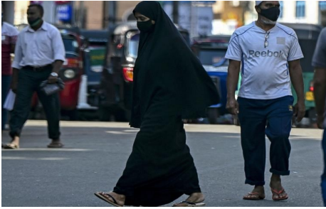
Sri Lanka's cabinet has approved a ban on full-face veils worn by some Muslim women, saying that they pose a threat to national security.

Sri Lanka's cabinet on Tuesday 27th of April 2021 approved a proposed ban on wearing full-face veils including Muslim niqabs in public, citing national security grounds,.