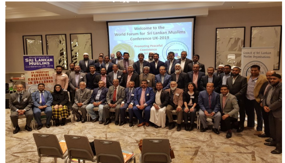
Picture from the launch of the WFSLM, London, October 2019

WFSLM was established as an alliance body to bring together all overseas Sri Lankan Muslim organizations and individuals to have a unified voice in matters concerning the Muslims living in Sri Lanka. As an independent, apolitical body, it will harness all available resources of the Muslim diaspora and