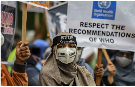
Protesters took to the streets to push for a change in policy

Sri Lanka's previous requirement to cremate anyone who dies from Covid-19 goes against public health guidance and discriminates against the Muslim and Christian communities in particular noted the Human Rights Watch. The government's spurious argument that burial in accordance with